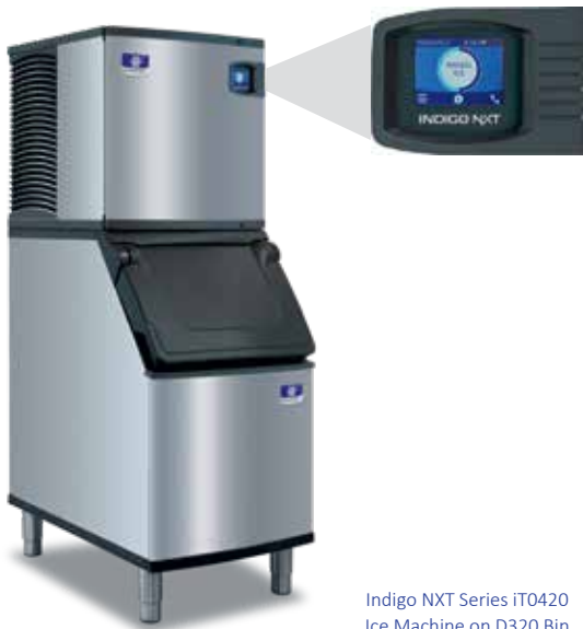
Indigo NXT Series iT0420 Ice Machine on D320 Bin

Designed for operators who know that ice is critical to their business, the Indigo NXT Series ice machine's preventative diagnostics continually monitor itself for reliable ice production. Improvements in cleanability and programmability make your ice machine easy to own and less expensive to operate.